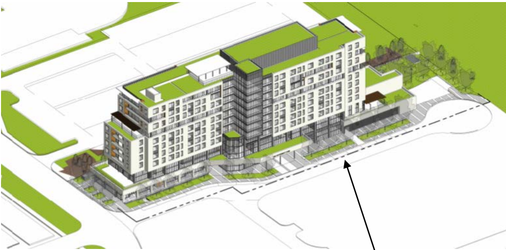
25 Glen Watford Drive proposal Proposed public street