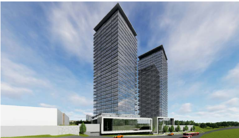
23 Glen Watford Drive proposal – view from Sheppard Avenue East